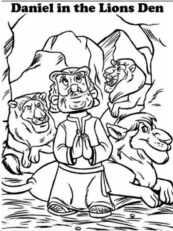
Daniel In The Lion's Den Daniel Ch. 6

Daniel prayed everyday three times a day to God. There were some men that did not like Daniel because King Darius was going to put Daniel in charge over them. These bad men looked for a way to get Daniel thrown into the den of lions. They couldn't find any fault in him. They knew he prayed to God so they used that as a way to have him killed. The men went to the king, and had a decree signed that if any man asked something from any God or man in 30 days that he would be thrown in the den of lions. Daniel got caught by the men and was thrown in the den. The angel shut the lions mouths, and they didn't eat him. The Lord protected Daniel.