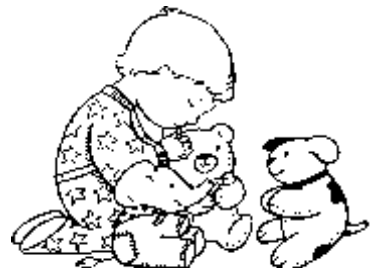
God Hears and Answers Prayers

Merciful God, we pray for peace to ring out in our hearts and in our homes; for mercy and forgiveness to reign in every community; for war to cease and hunger to end. Give us this joy now, Holy One. In Jesus name we pray. Amen.